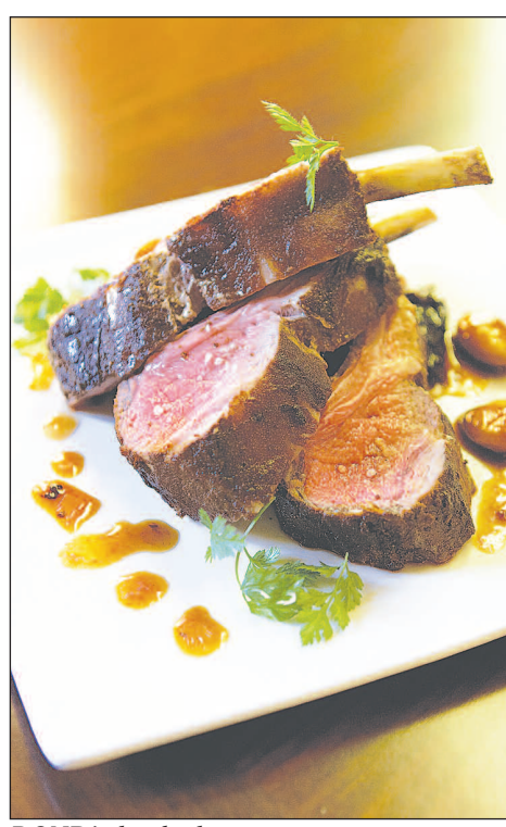
BOND's lamb chops